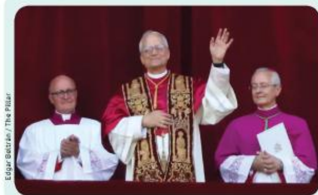
Edgar Beltrán / The Pillar