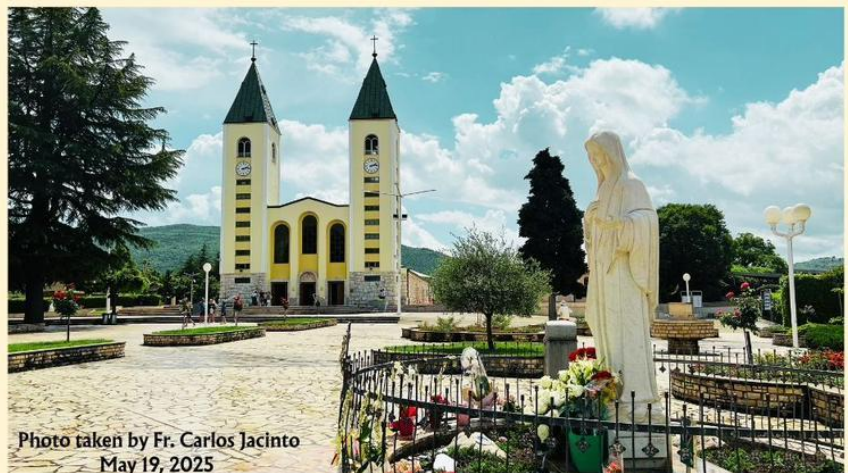
May 19, 2025